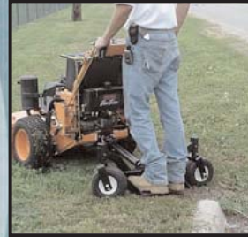
Backs up easily