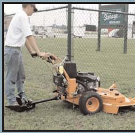
Large platforms reduces fatigue