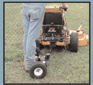
Operator stays behind the mower